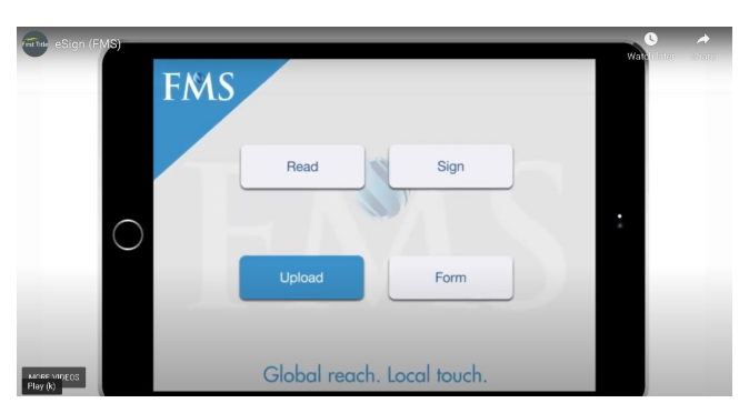
Step 4: Action