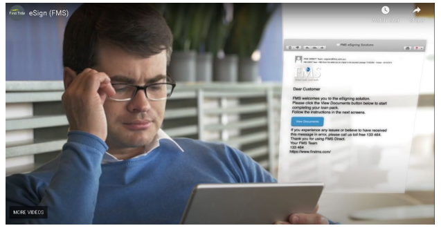
Step 1: Email Received

Here are some screen shots on what you should see once you are ready to commence: