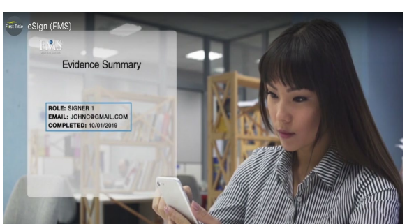
Step 7: Confirmation