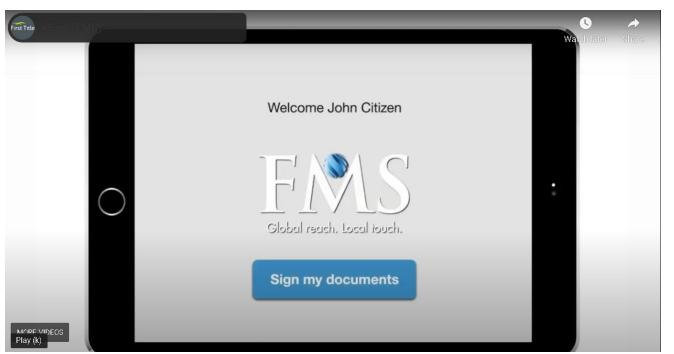
Step 3: Access Documents